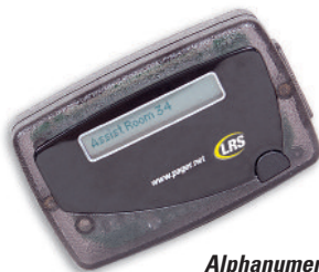
Alphanumeric Pager Two models to choose from