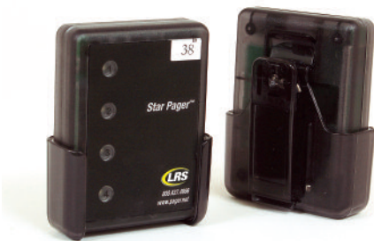
Nursery & Daycare Pagers Nine models to choose from

Butler II can also be used for staff-to-staff paging. Mount it at the front desk so the receptionist can call for the manager, trainers, massage therapists or other staff members when an appointment arrives.