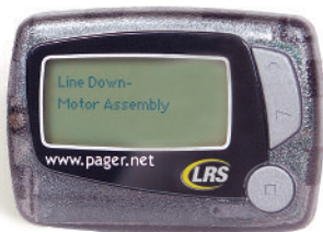
Battery-Operated Alphanumeric Pager