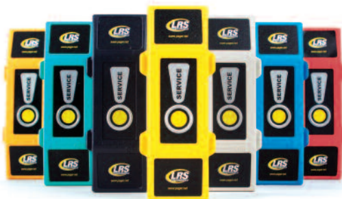
Colors Available: Yellow, Black, Bone, Blue, Coral, Coastal Green, Mango Orange

Beach Butler works with both LRS Alphanumeric pagers.