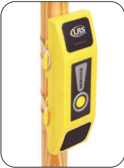
Beach Butler can also be mounted with rubber bands, Velcro strips or optional umbrella clip.