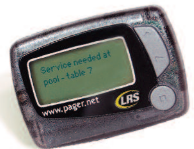
4-Line Battery-Operated Alphanumeric