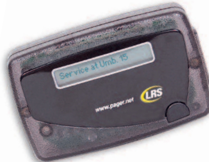
1-Line Rechargeable Alphanumeric